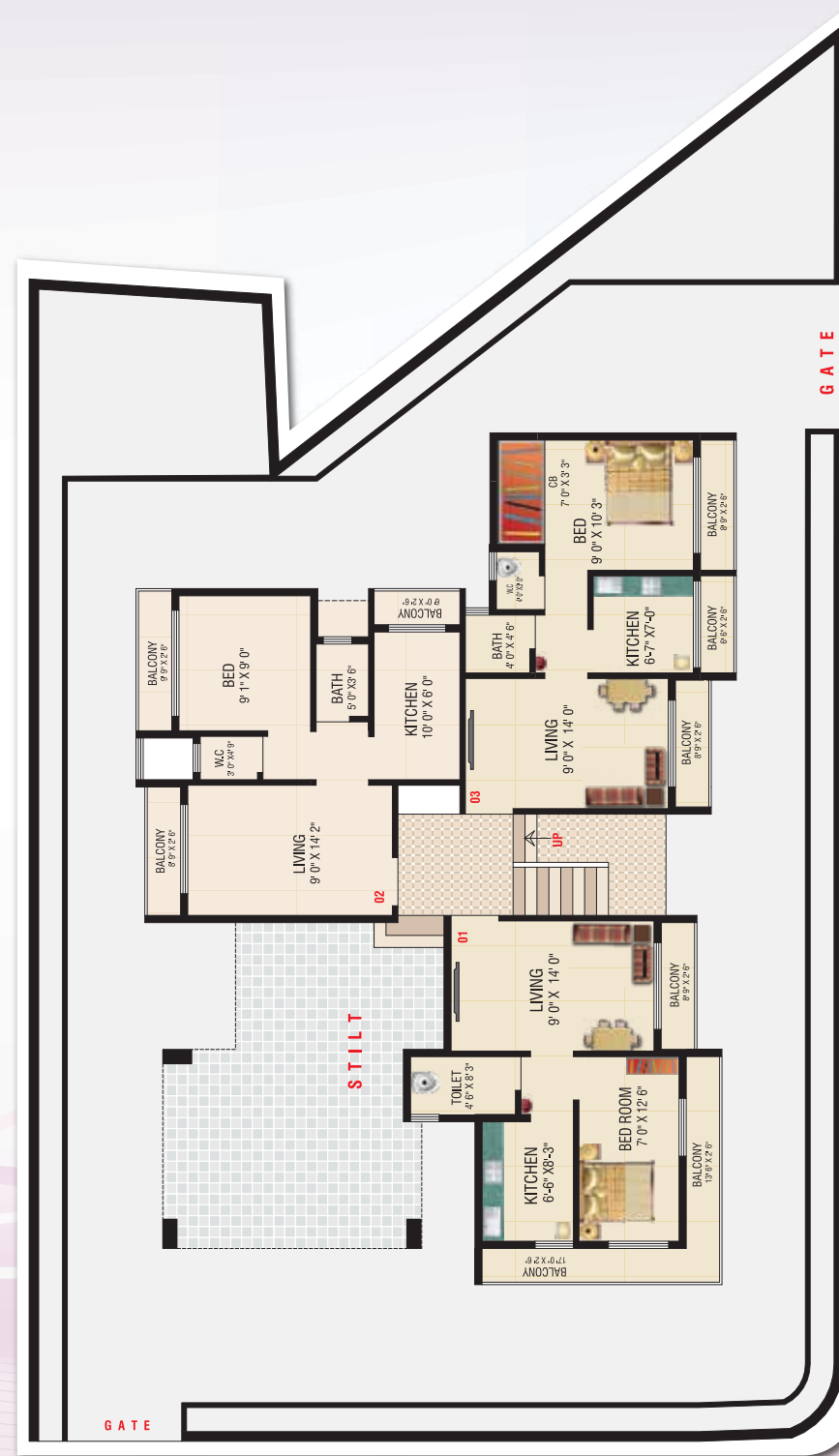
9.0 M. WIDE ROAD GROUND FLOOR PLAN