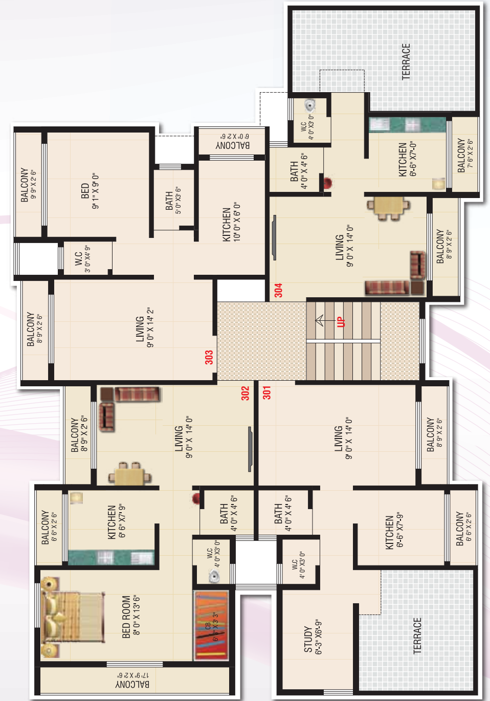
9.0 M. WIDE ROAD 3RD FLOOR PLAN