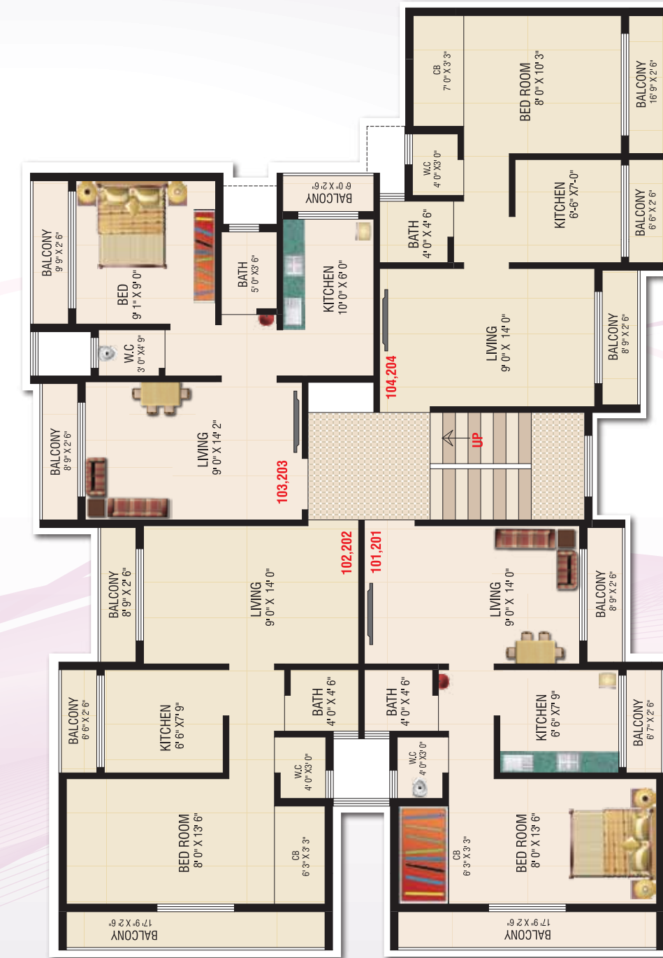
9.0 M. WIDE ROAD 1ST & 2ND FLOOR PLAN